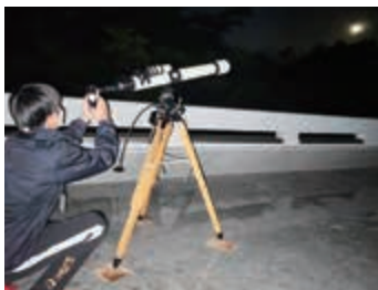
Astronomical observation with an astronomical telescope given to him by his uncle

The impact of this experience stayed with him and nurtured his interest in astrophysics, especially black holes. His interest was heightened by the news he heard in junior high school about the successful filming of a black hole.