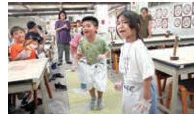
Making udon noodles to the cheering tambourine.

These marine activities were meant to connect to larger challenges. For instance, those who experienced kayaking at a younger age will understand ocean currents and safety precautions when near or on the sea. Through firsthand experiences and understanding, older students would then try to reach an uninhabited island by boat. Growing mentally and physically through these experiences, and taking on larger challenges leads to confidence and nurtures a curiosity to know more about the world.