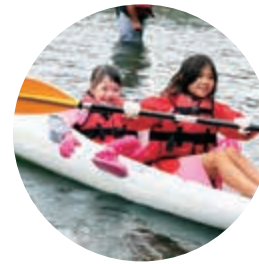
Receiving a lecture on rowing techniques, and off we go!

Kamikatsu Town, located about an hour's drive from Tokushima City, is the least populated town in Shikoku with approximately 1,300 residents (as of September 2023). In 2003, they became the first in Japan to declare a 'Zero Waste' policy, aiming for a society where garbage is not disposed of and not generated. They implemented the sorting of waste into the most detailed categories in Japan, with a total of 13 types and 45 classifications. The town achieved a recycling rate of 80.6% in 2019.