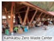
Kamikatsu Zero Waste Center