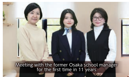
Meeting with the former Osaka school manager for the first time in 11 years

In order to check the progress after one year of lessons at "Osaka Global Juku"®, organized by Osaka Prefectural Government, I took the IELTS exam. Test preparation lessons were part of the classes which were held once a week for 3 hours. I also had many practical lessons such as writing and speaking English.