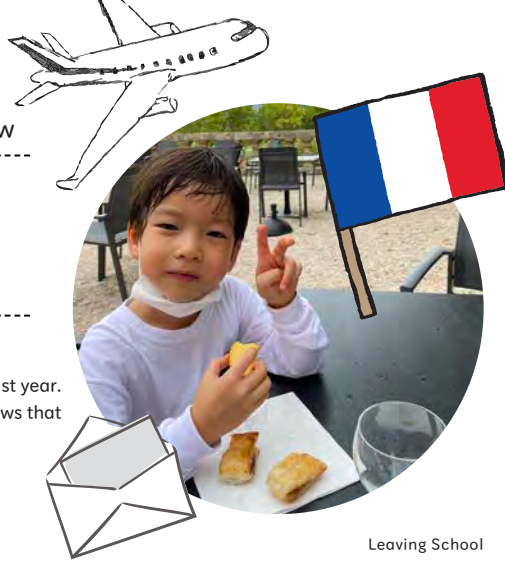
Leaving School Extracurricular Activities

Before moving to France, he was sad that he would have to leave his beloved Kinder Kids and be separated from his friends, so I kept telling him that there would be many exciting things to do in France, I'd say "Let's go camping" and "Let's go to the beach every day! Until we left Japan, friends of Kinder Kids spent their time playing with him a lot, and in class, they wrote and gave letters to my son. Thanks to all of you, we had a lot of beautiful memories that we will never forget, and we are grateful for the kind teachers and friends we had at Kinder Kids. Even now, we keep in touch with his friends by writing letters.