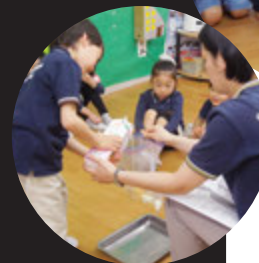
Hands on learning